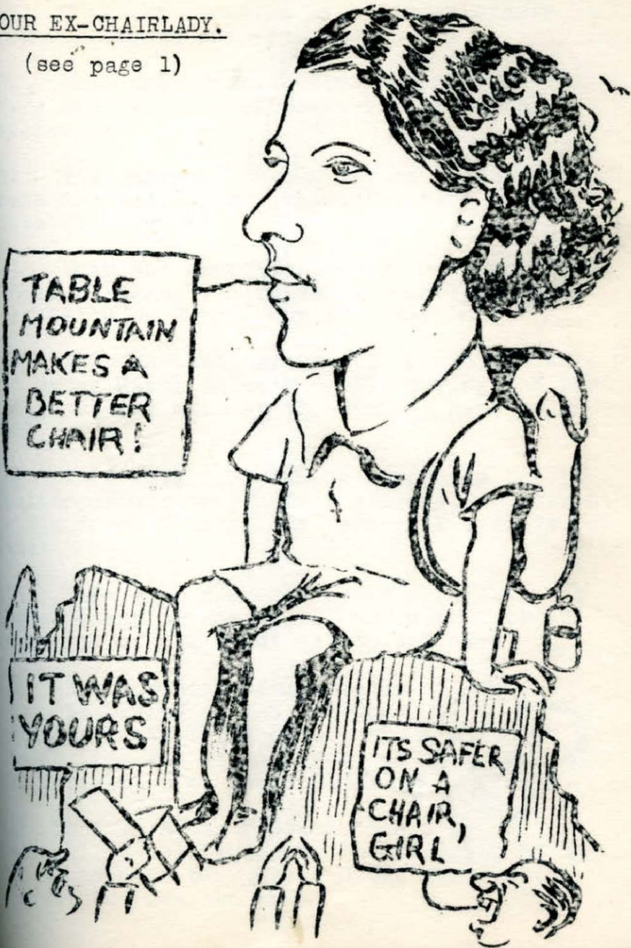
TABLE MOUNTAIN MAKES A BETTER CHAIR!